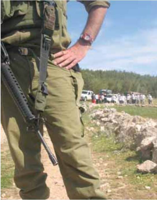
Soldiers wishing to prevent a confrontation between violent settlers and Palestinian villagers or internationals often restrict the latter groups in order to avoid standing up to the settlers.

youth, on the other hand, were terrified. A woman from Operation Dove, an Italian peace team stationed in At-Tawani, began to sing “Old MacDonald Had a Farm” in Italian with the children to distract them. It was very effective, and I felt inspired by her creativity in making the situation less tense. The soldiers stood over us and sent the approaching settlers off to the side. Fortunately, they complied. They held hands and skipped off towards Ma’on settlement, leaving us all to catch our breath—soldiers included.