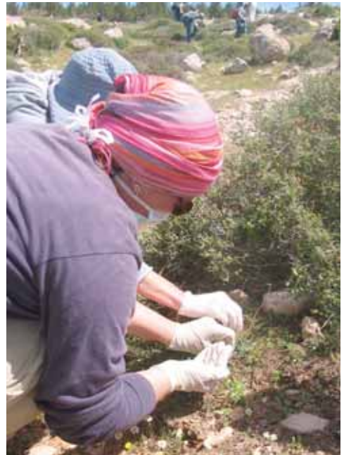
Israeli activists, international volunteers, and Palestinian villagers work together to remove poison from At-Tawani's land. Settlers placed barley seeds boiled in rat poison under shrubs with the intention of killing village sheep to discourage farmers from going to their land.

The army was stationed in At-Tawani yesterday to "protect" our official action from the settlers, but instead they only made our job harder. First they threatened the shepherds who were grazing sheep on a nearby hill. Although the land belongs to the villages, settlers have claimed it, rendering it a "disputed area." So the army has taken control and pronounced it a "closed military zone." The action was intentionally planned on a Saturday because on weekends the area is officially supposed to be open. But the soldiers told them to go to another area, where we were picking out poison. We insisted that the sheep couldn't graze there or they could be poisoned, but the soldiers didn't seem to care. They were worried about a confrontation between us and the settlers who had started to come