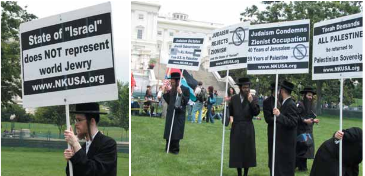
Hasidic Jews protest Zionism in Washington DC.

This is not a conflict of the Jewish people versus the Muslim people. First of all, 20% of Palestinians worldwide are Christians, and they are subject to the same restrictions as their Muslim counterparts. Israel has a strong peace movement calling for an end to the mutually-destructive Occupation, and many Jews find Zionism itself antithetical to Jewish principles.