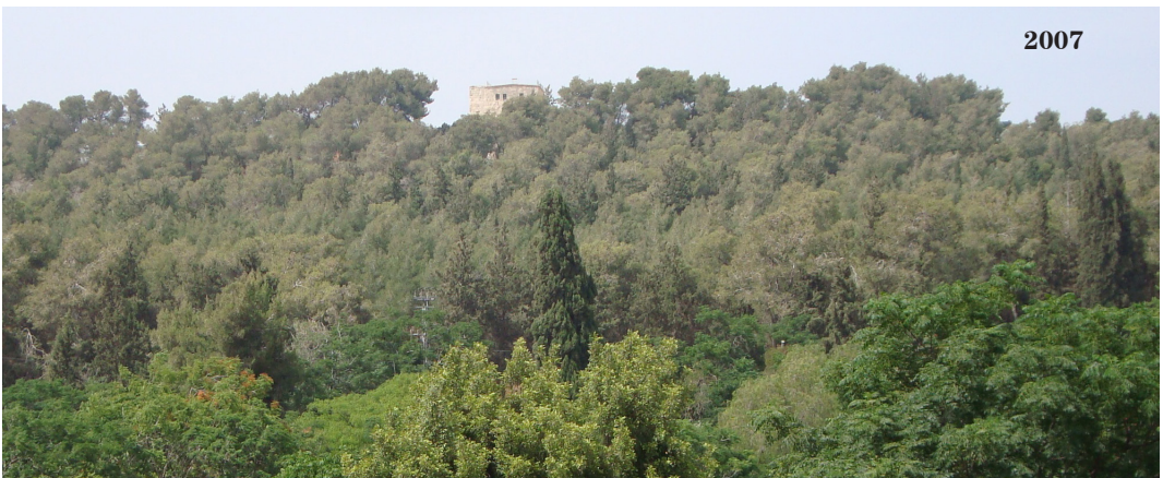
Hundreds of Palestinian villages like Saffourieh (pictured above) were planted over with trees after their residents were forced to flee in 1948, and now lay vacant.